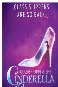
Rodgers & Hammerstein's Cinderella May 19-21, 2017

This mind-blowing spectacular showcases the jaw dropping talents of seven of the most incredible Illusionists on earth. THE ILLUSIONISTS™ – LIVE FROM BROADWAY™ is packed with thrilling and sophisticated magic of unprecedented proportions.