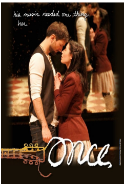
Once Nov. 18-20, 2016

ONCE tells the enchanting tale of a Dublin street musician who's about to give up on his dream when a beautiful young woman takes a sudden interest in his haunting love songs. It's an unforgettable story about going for your dreams...not living in fear... and the power of music to connect all of us.