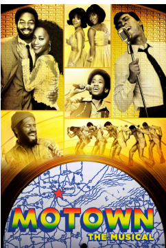
Motown: The Musical Jan. 24-29, 2017

ELF THE MUSICAL is the hilarious tale of Buddy, a young orphan child who mistakenly crawls into Santa's bag of gifts and is transported back to the North Pole. This modern day Christmas classic is sure to make everyone embrace their inner ELF .