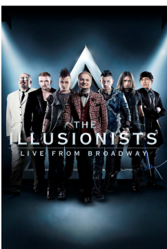
The Illusionists Apr. 28-30, 2017

DIRTY DANCING is a record-breaking live theatre sensation, exploding with heart-pounding music, passionate romance, and sensational dancing. Featuring the hit songs "Hungry Eyes," "Hey Baby," "Do You Love Me?," and the heart-stopping "(I've Had) The Time of My Life."