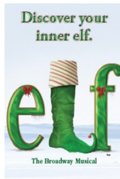
Elf the Musical Dec. 16-18, 2016

ONCE tells the enchanting tale of a Dublin street musician who's about to give up on his dream when a beautiful young woman takes a sudden interest in his haunting love songs. It's an unforgettable story about going for your dreams...not living in fear... and the power of music to connect all of us.