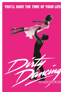
Dirty Dancing Feb. 24-26, 2017

MOTOWN THE MUSICAL is the true American dream story of Motown founder Berry Gordy's journey from featherweight boxer to the heavyweight music mogul who launched the careers of Diana Ross, Michael Jackson, Smokey Robinson, and many more.